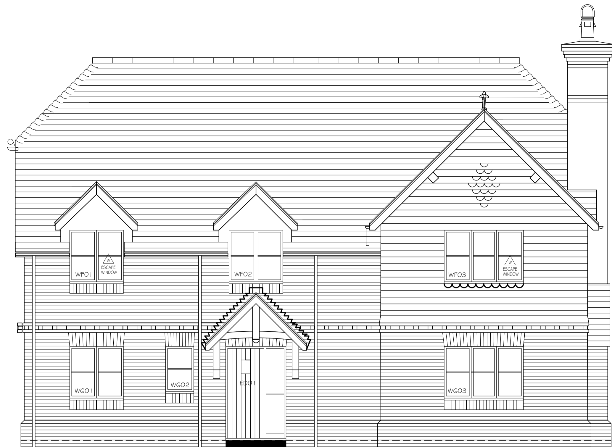
PLOT 1 FRONT ELEVATION